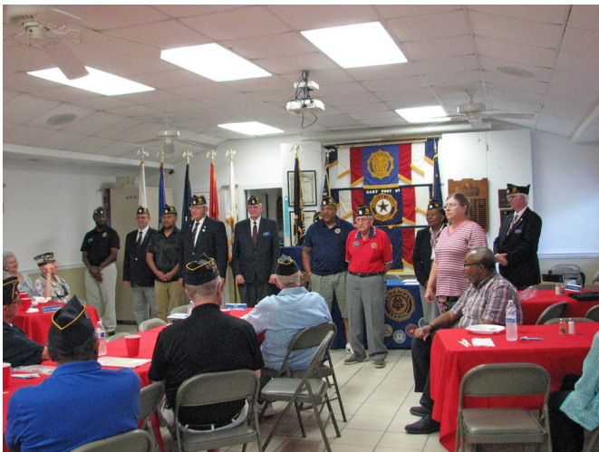
The Post 67 Officers for the 2022/2033 Tenure