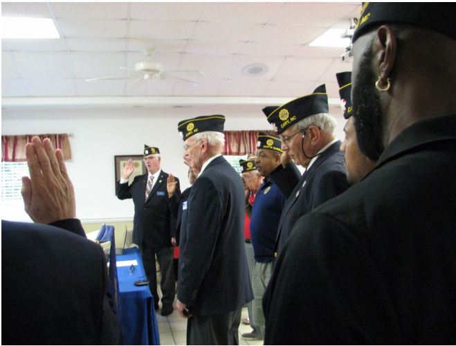
The New Post 67 Officers Pledge to Perform Faithfully and Impartially