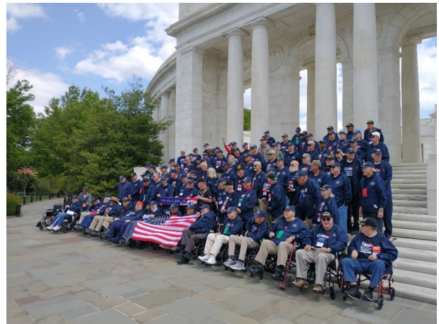
Triad Honor Flight, April 28, 2022